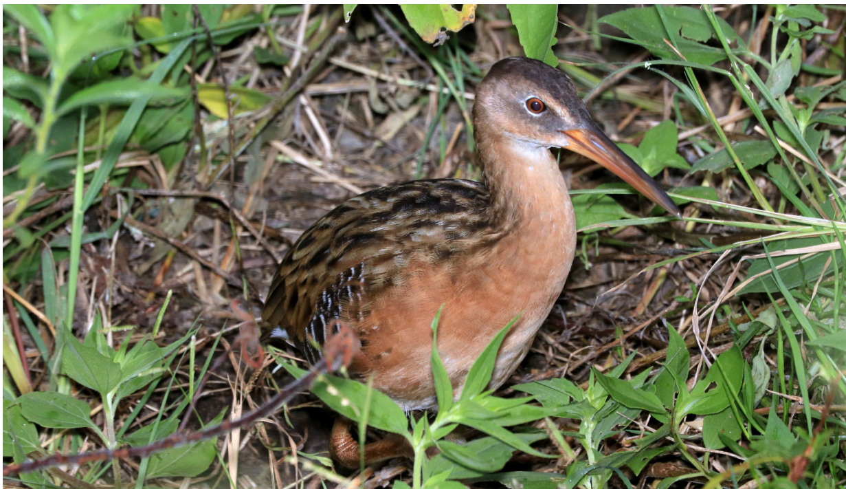
King Rail

Navassa Island (administered by the USFWS as a NWR)