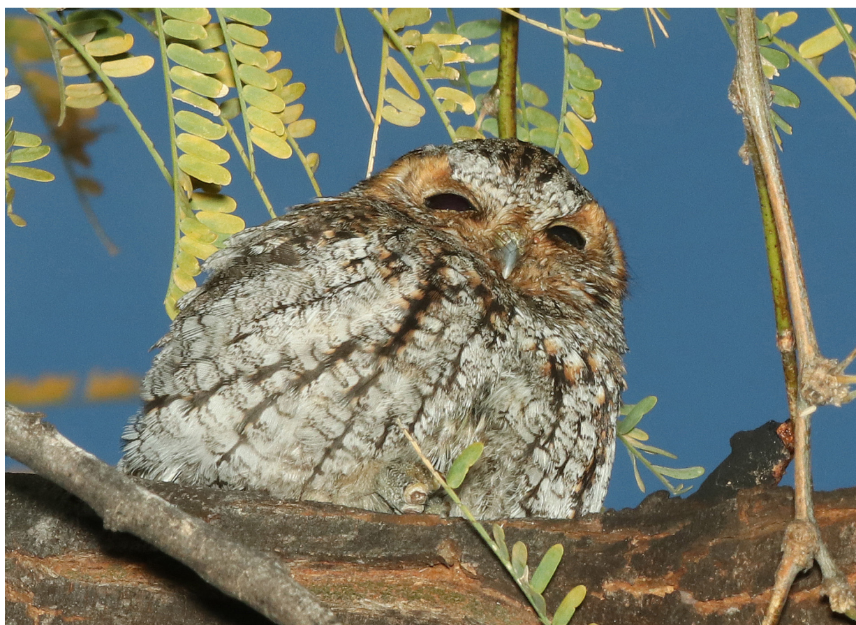
Flammulated Owl

5 Ducks; grebes; rails, gallinules and coots; limpkins; cranes; loons; storks; cormorants; pelicans; and herons and egrets.