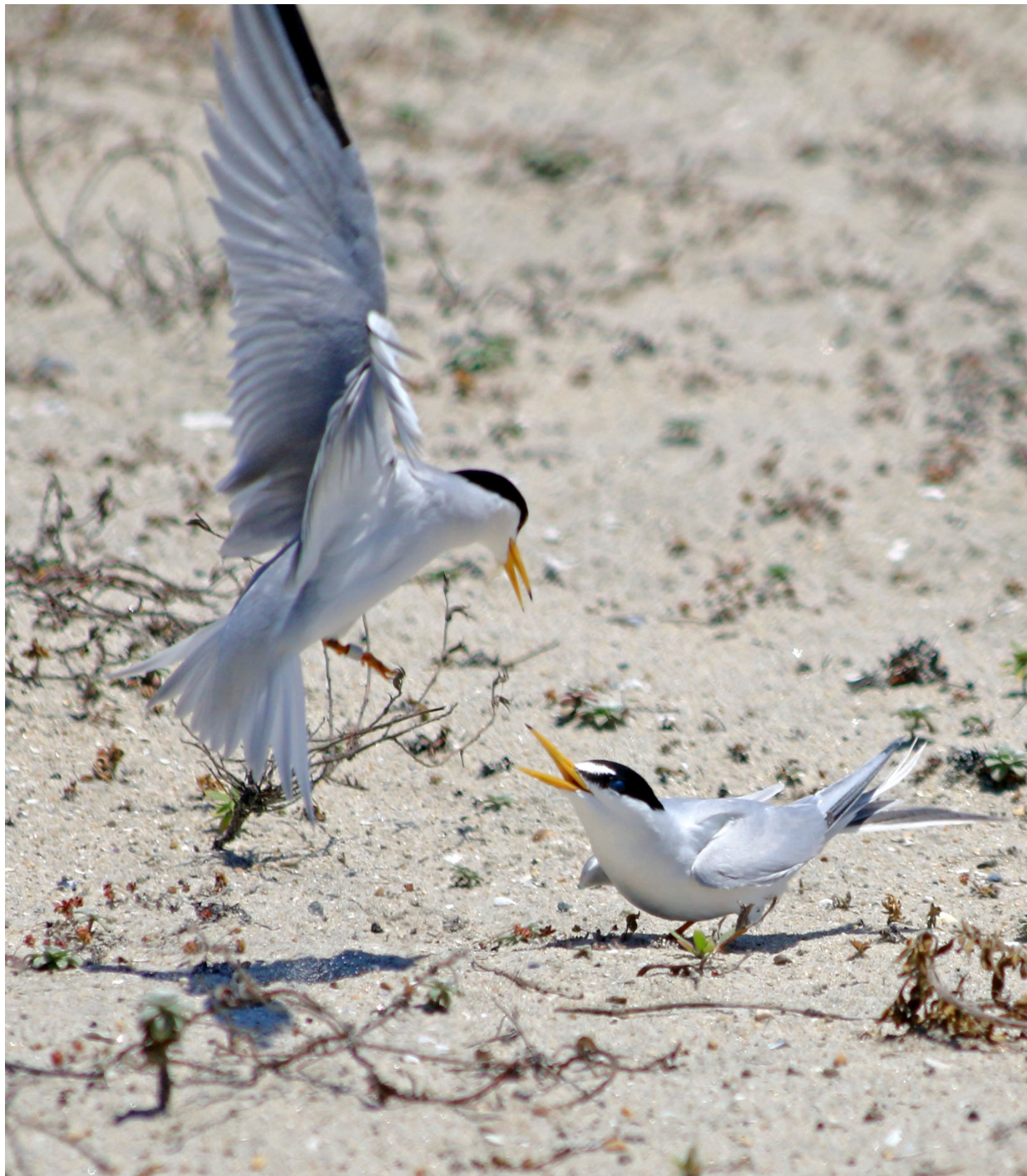
Least Tern

1 Continental list and (additional BCR-scale taxa).