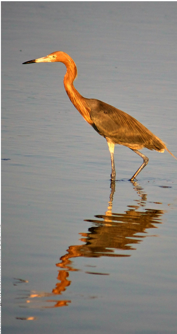
Reddish Egret